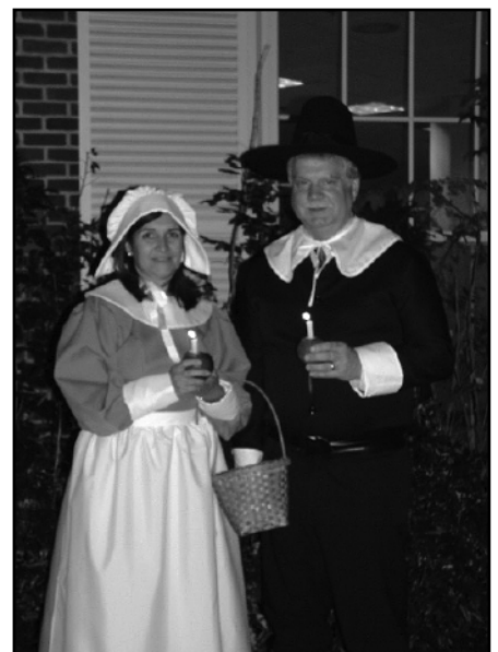
"Thanks For Giving" Dinner