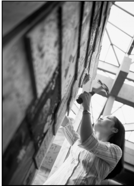
A Student Participates

Go to http://www.tcnj.edu/~magazine/05Fall/documents/studentnews.pdf to read about these students in TCNJ's online magazine.