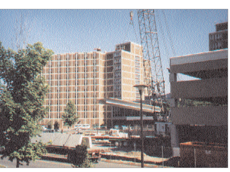
A crane lifts a prefabricated section of concrete floor into place at the new parking garage serving the Travers/Wolfe residential towers.

Local public concern over plans for a parking garage that would be close to a residential area along Pennington Road prompted a Ewing Township planning board to suggest building student housing on the site instead. At press time, negotiations for the purchase of two properties needed for the housing were still under way, but it seemed likely