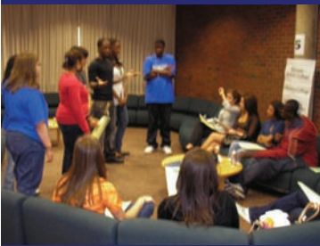
TCNJ presenting Bystander Intervention at Peer Institute